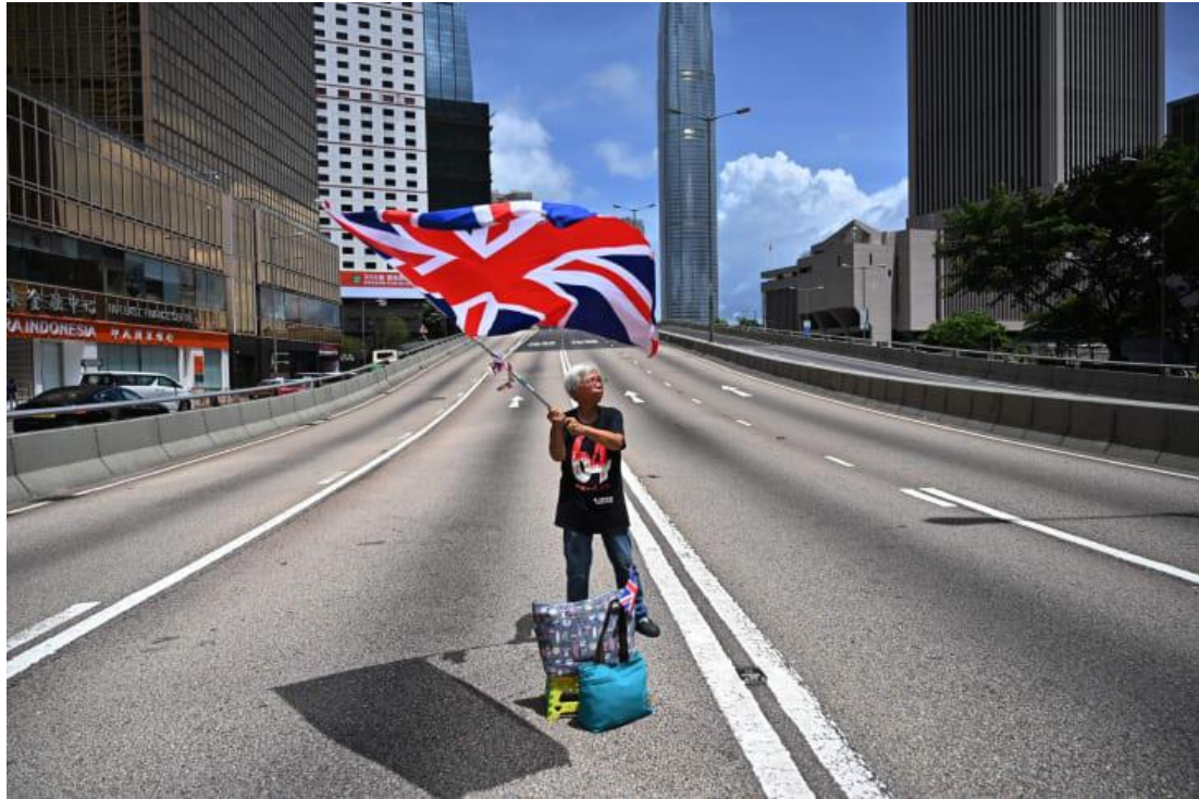
Figure 18: A protester waving the British flag.

Kong bleeding. Of democracy dying. There have also been other versions where the Bauhinia flower is wilting, to symbolise the dying nature of Hong Kong. In addition, the very nature of the colour of the flag being turned black is in itself a symbol of darkness over powering Hong Kong.