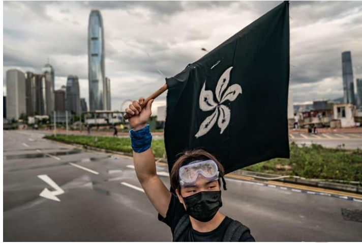
Figure 20: “Flags at half-staff outside Hong Kong's Legislative Council the day after hundreds of pro-democracy protesters broke into chamber.” (Caption and Image Courtesy: CNN Style)