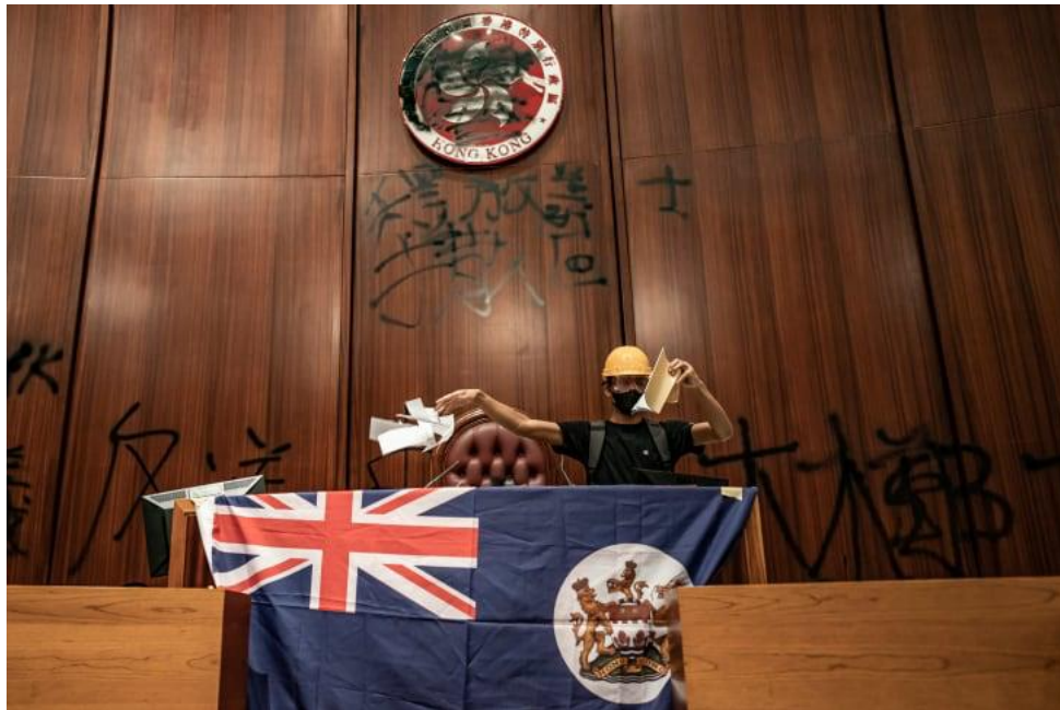
Figure 17: A protester with the Hong Kong Colonial flag draped on the podium of the Legislative Chamber

The black Bauhinia flag has come to be symbolic of the 2019 Hong Kong Protests. In addition, some protesters even wave the British flag as a cry for the return of democracy to Hong Kong.