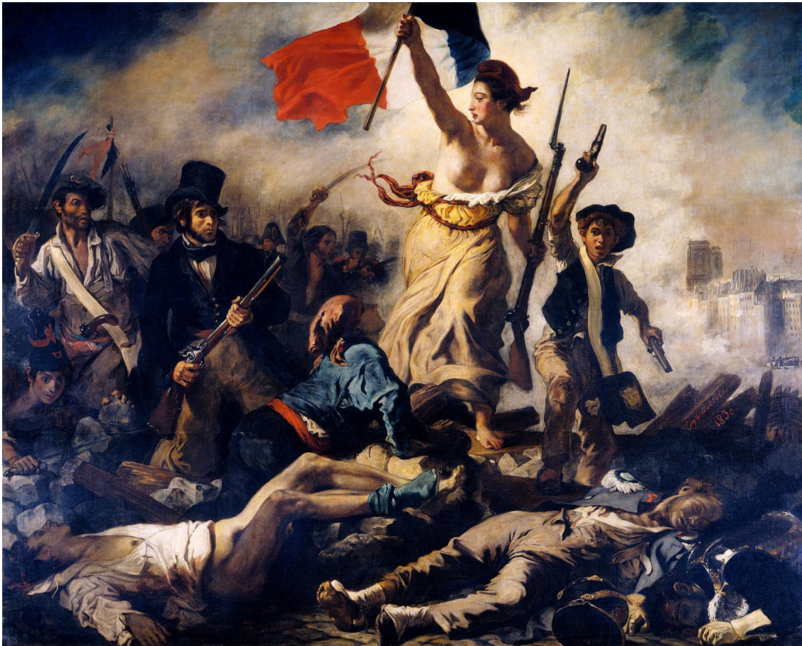
Figure 8: The original Liberty Leading the People by Eugene Delacroix

It has been noticed that most of the artists have chosen to remain anonymous. In doing this, as Kacey Wong, an artist, states that they create a new, fluid and united identity. Of having similar views and being united by these views. This makes their art quite effective and impactful.