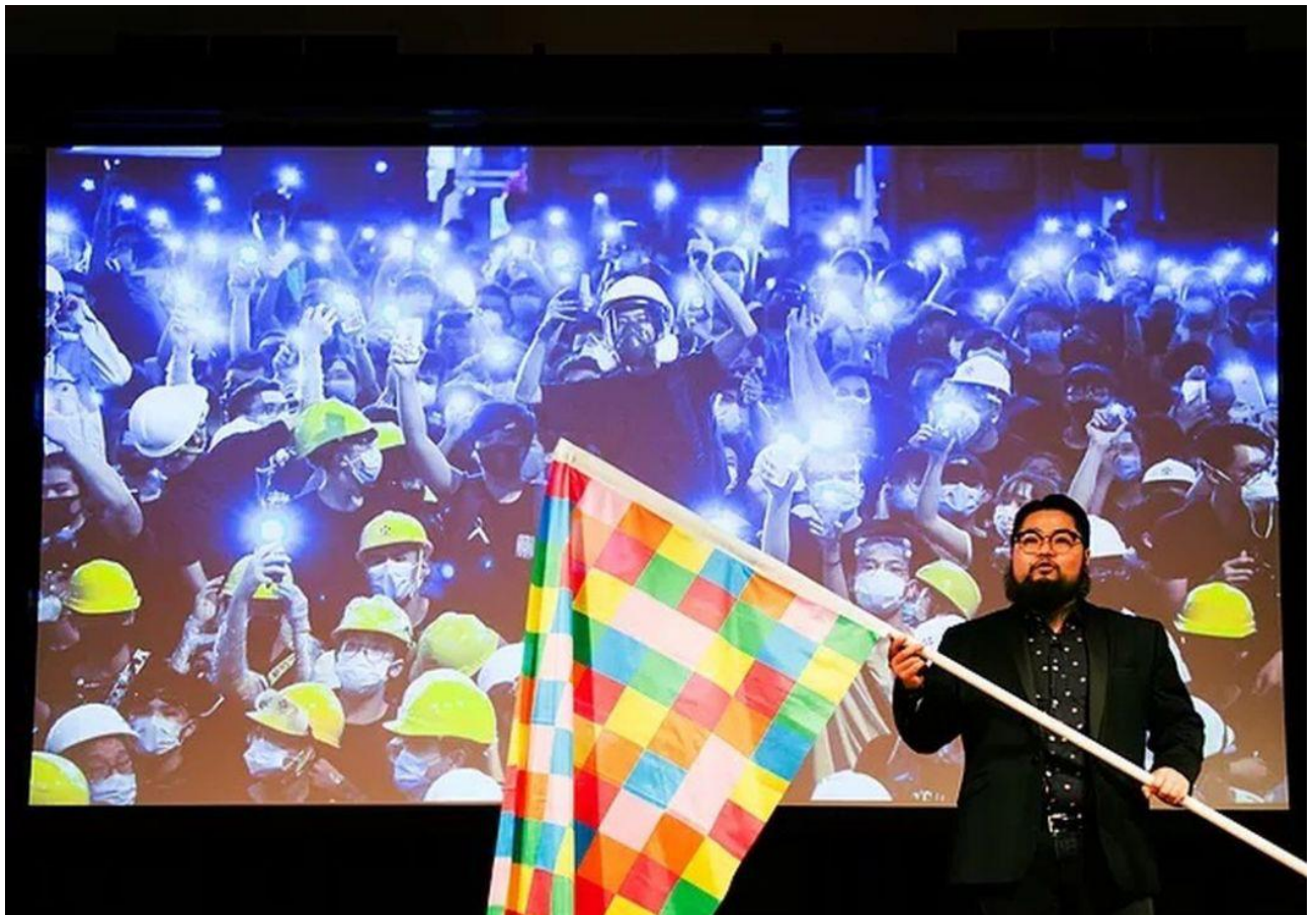
Figure 4: Badiucaio displays the Lennon Walls flag. Photo by: Badiucaio

as hope. A more colourful and delightful visual icon can accumulate hope much more effectively,”... “That is why the vibrantly coloured Lennon Wall Flag design can be a great supplement to the black flag. The simple beauty of it could win Hong Kong more support around the world.” (Chan, Hong Kong Free Press.)