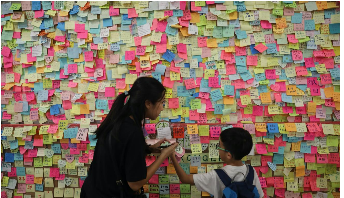
Figure 2: Children and the Lennon Walls.