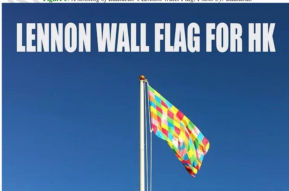
Figure 5: A hoisting of Badiucaio’s Lennon Walls Flag.