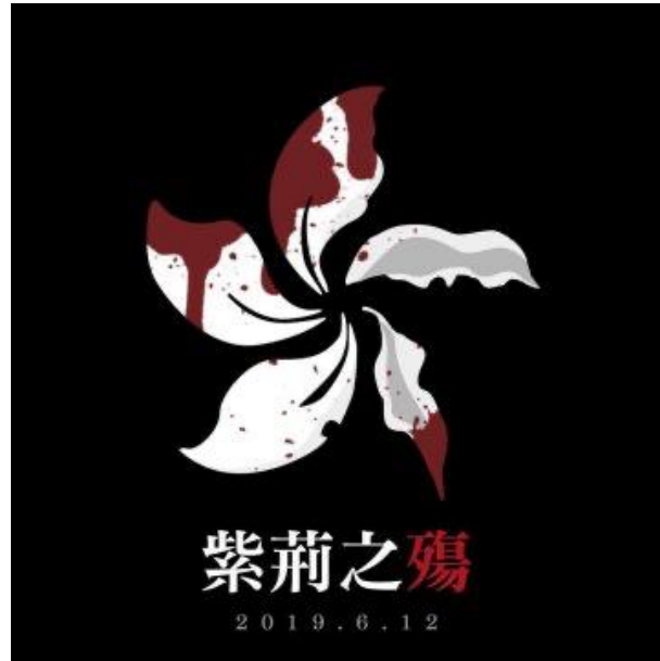
Figure 21: “Y created this image of a bloodstained black-and-white bauhinia after police used tear gas and rubber bullets to disperse protesters outside Hong Kong's Legislative Council on June 12.” (Caption and Image