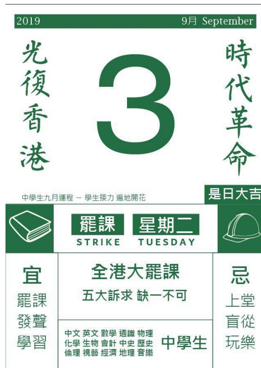
Figure 15: Artwork in the style of a Chinese calendar, urging students to boycott classes on 3rd of September, 2019. (Image courtesy: TIME)

The above shown artworks are among some of the many works of art which have been produced during the months of the Hong Kong protests in 2019. We can see how there have been cultural, political, pop cultural as well as historical references that have been made. It is important to comment here that art today and for a long time now, has made the impact upon people's minds because it has been relatable to the people. Art today, has transcended the ideology of being only for the upper class and is for all to access. In fact, the very basis of digital art and memes is upon this basis.