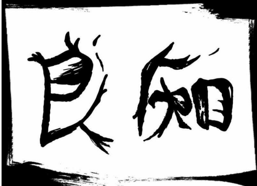
Figure 14: “When reading upright, the two characters mean “conscience.” When tilted 90 degrees counter-clockwise, one character becomes “return” and the other becomes an icon of an eye. The image refers to the incident where a female protester was hit in the eye by a projectile on Aug. 11.” (Caption and