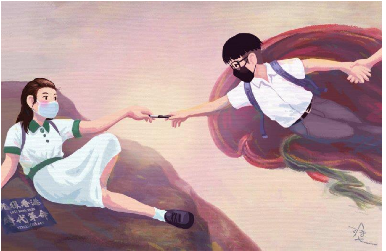
Figure 11: A piece of artwork by Arto talking about two school children supporting the school strike alluding to Michelangelo's fresco painting 'The Creating of Adam'