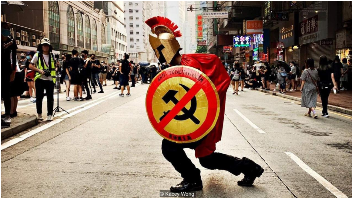
© Kacey Wong Figure 9: Kacey Wong's The Shield