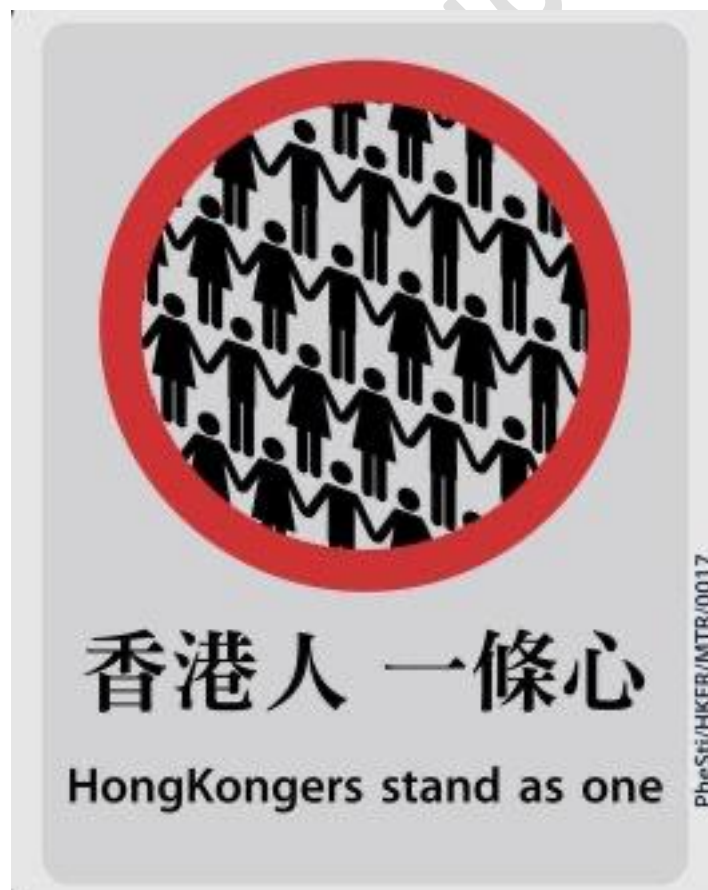
Figure 10: Anonymous artist Phesti creates a parody of subway signs alluding to the human chain created by Hong Kong protesters.