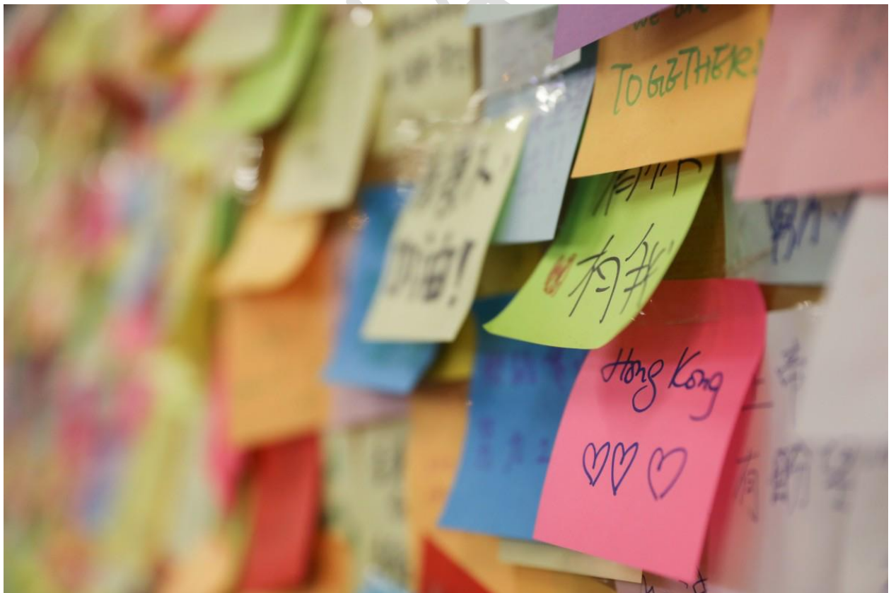
Figure 1: Sticky notes against the Extradition Bill.

The Lennon Walls has initially appeared during the 2014 Umbrella Movement in Hong Kong. The new Lennon Walls in Hong Kong have sprung up as result of the 2019 Extradition Bill and showcase a number of slogans and words of peace by pro-democracy protesters.